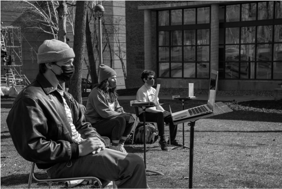
Rehearsal