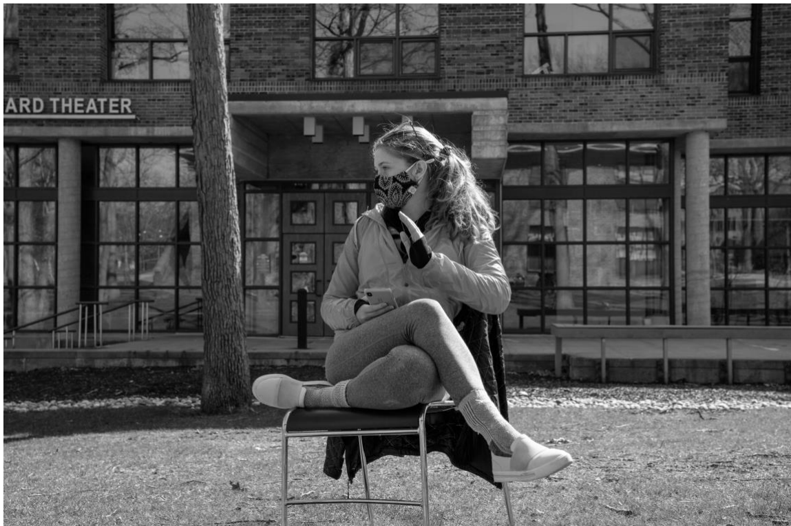
Rehearsal