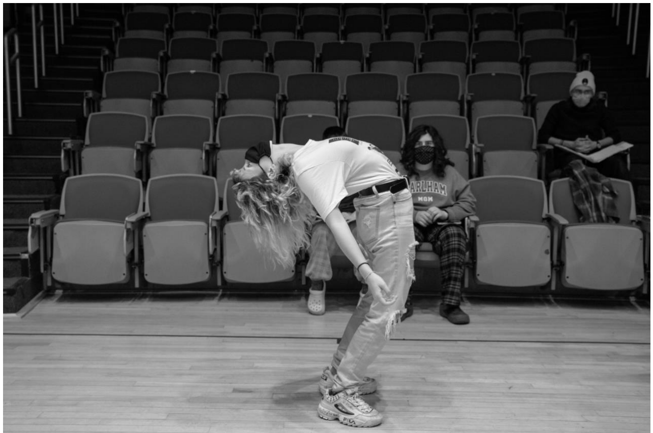
Rehearsal