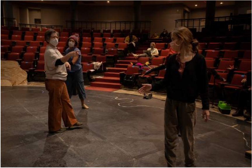
Rehearsal Photo, Coltrane Cho '24