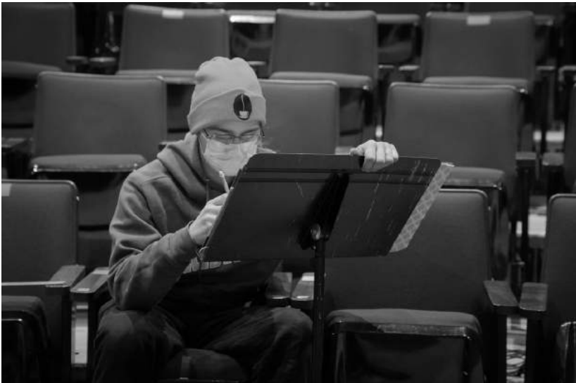
Rehearsal Photo, Coltrane Cho '24