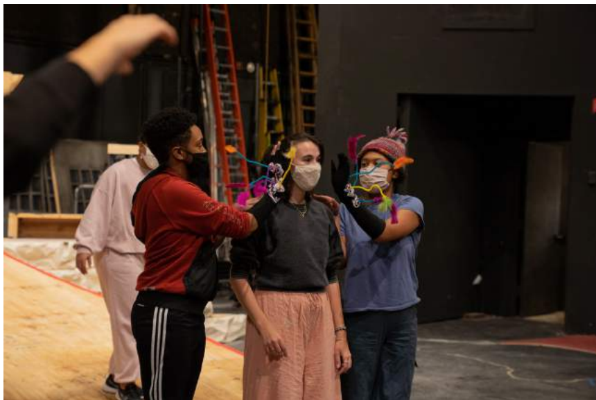
Rehearsal Photo, Coltrane Cho '24

WHERE: Cassandra's now defunct lab, a plot of desolate land that used to be a truffle farm not far from an unnamed city in the Pacific Northwest, a desolate highway in Montana, and a beach on the Pacific Ocean.