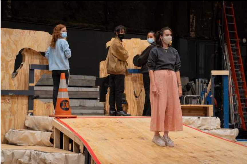
Rehearsal Photo, Coltrane Cho '24

This production has been made possible in part through the support of The Hispanic Federation.