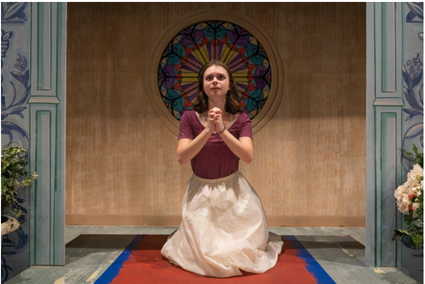
Rehearsal Photo, Coltrane Cho '24