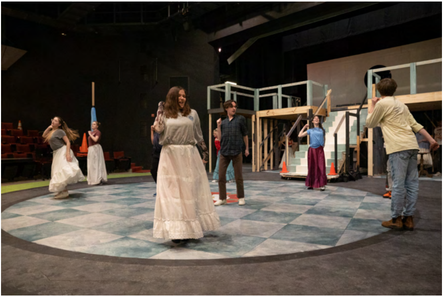
Rehearsal Photo, Coltrane Cho '24