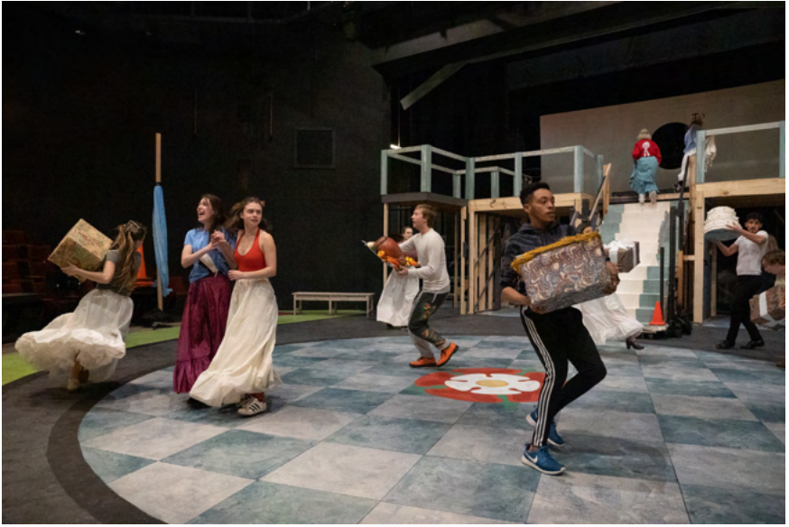
Rehearsal Photo, Coltrane Cho '24