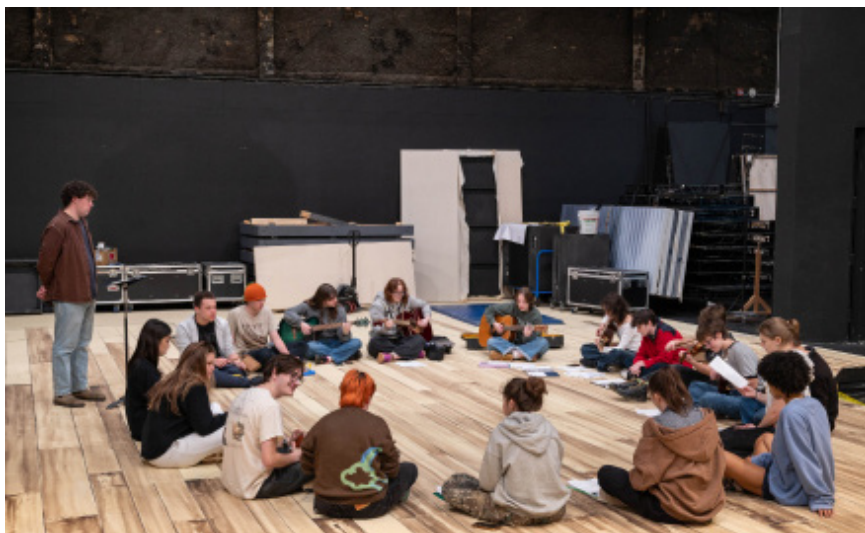
Rehearsal Photos by Logan Waugh