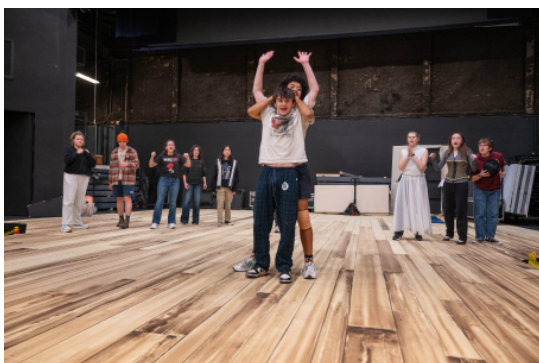
Rehearsal