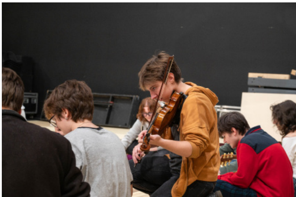
Rehearsal Photos by Logan Waugh