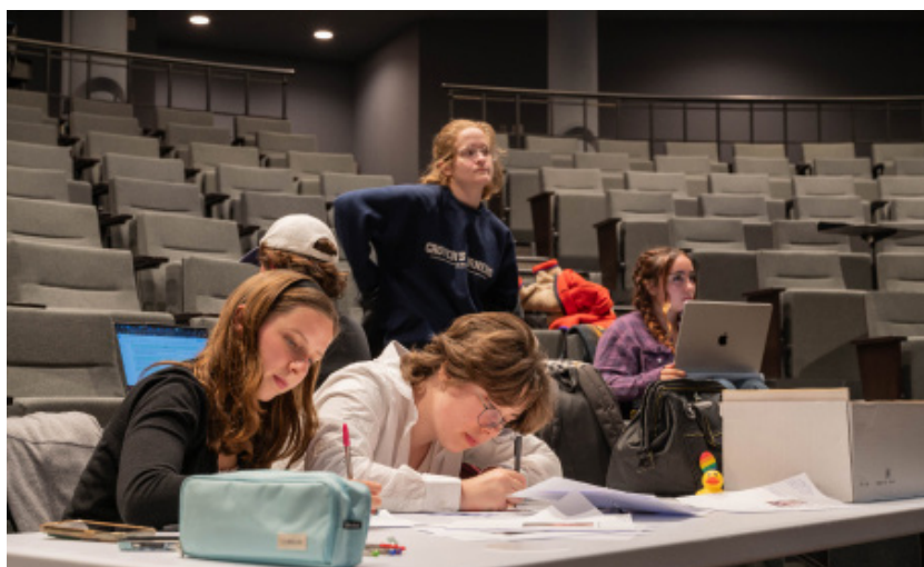
Rehearsal Photos by Logan Waugh