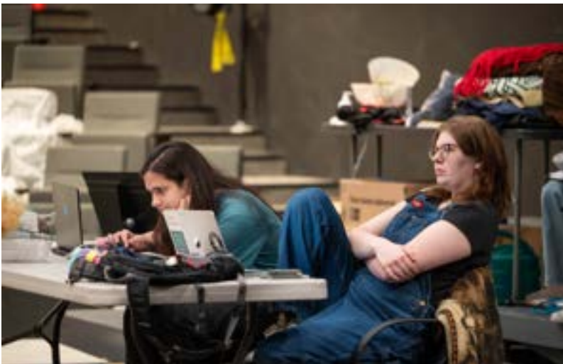
Rehearsal